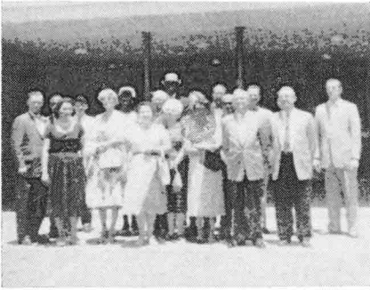
Dixie Deaf Lutheran Conference meets at Pensacola, Fla.