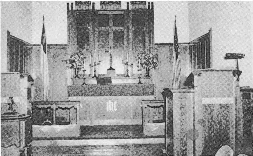
Ebenezer Chapel for the Deaf