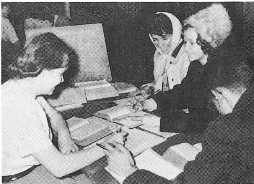
Four pupils in the pastor's confirmation class