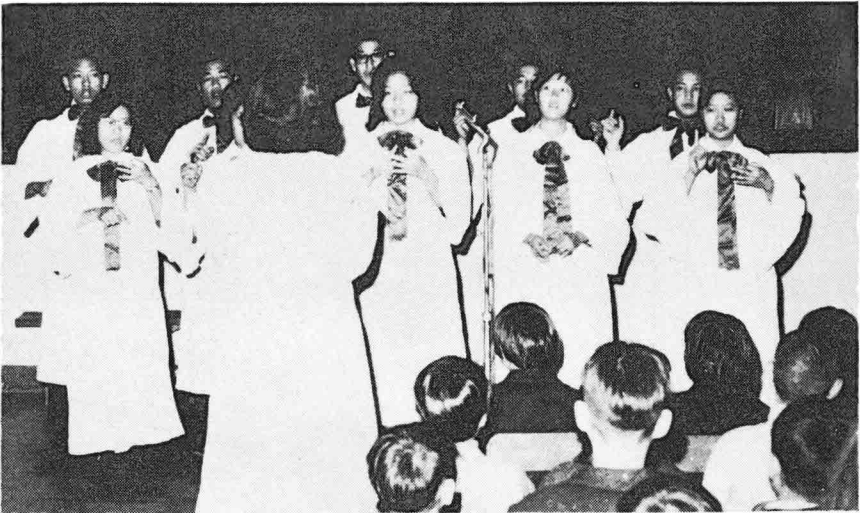
The deaf choir from the Chatham Road Chapel sing at the Christmas program. They are signing "name"

A special Christmas service was arranged for the deaf on December 26. It was a combination of service and program. Both the Hong Kong and Kowloon deaf groups took part with choirs and skits. The Hong Kong group presented the Nativity as a pageant, and the Kowloon group gave a three-act play. Although the