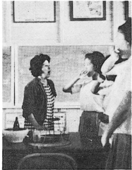
Class in physics in the high school department of the deaf school

Estimates of the deaf in the Philippines range from 30,000 to 70,000