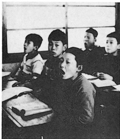
Deaf students in a speech class at the National School for the Deaf in Seoul, Korea

The deaf population in Korea is estimated to be between 30,000 and 100,000 people. The most frequently heard figure is 70,000 deaf, although I found no proof for this figure either. The Ministry of Health and Social Affairs gave me a figure of 14,983 deaf