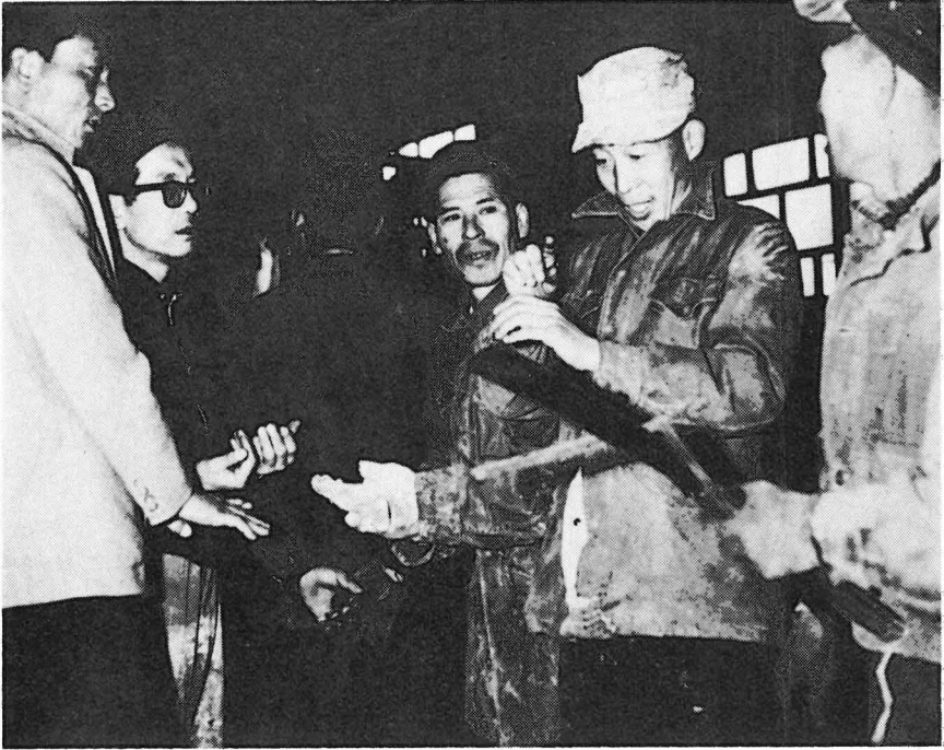
Deaf workers talk with each other at the noodle factory at the Village of the Silent, Seoul