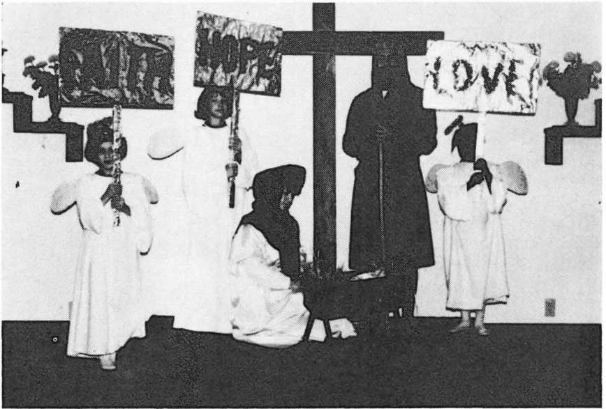
The young people and Sunday school children of Christ Lutheran Church (Deaf), Cleveland, Ohio, present a Christmas pageant in a worship setting. The theme for last year's pageant is expressed in the banners held by the cherubim, "Praise to the Lord for His Precious Gifts of Faith and Hope and Love"

adults praised the Lord for His gifts to His children — gifts of faith, hope, and love.