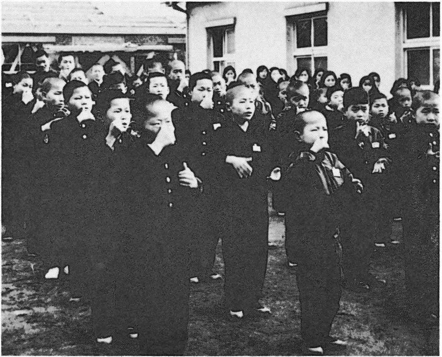
Deaf children attentively sign their morning worship exercises at the Junnam Deaf School, Kwang Ju, Korea