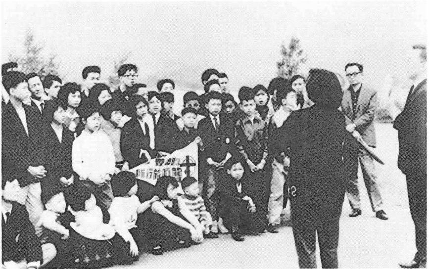
Hong Kong Deaf Picnic