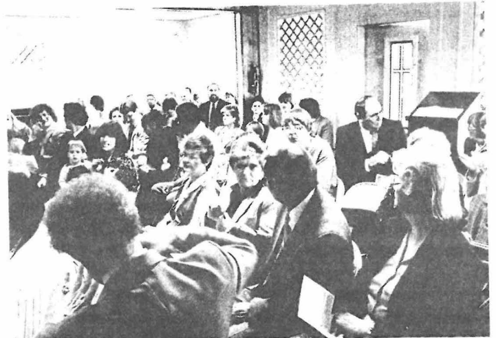
Chapel for the Deaf overflows at the first worship service.