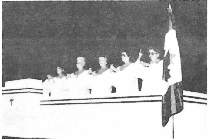
"LIFT HIGH THE CROSS" --Ladies from Prince of Peace choir, Indianapolis, sing the song during opening devotions during the synod's convention.