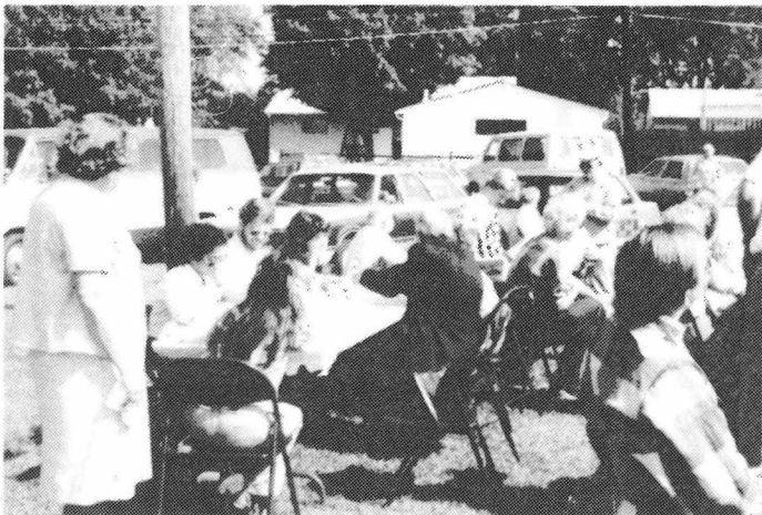
PICNIC TIME --Members of Peace Lutheran church, Indianapolis, get together. How many can you identify?

Lord, our Lord, Your greatness is seen in all the world! Your praise reaches up to the heavens; It is sung by children and babies. You have built a fortress against Your foes to stop your enemies and adversaries. When I look at the sky, which You have made, at the moon and the stars, which you set in their places-- What is man, that You think of Him; mere man, that You care for him? Yet You made him inferior only to Yourself; You crowned Him with glory and honor. You made him ruler over all You have made; You placed him over all things: Sheep and cattle, and wild animals too; the birds and the fish, And all the creatures in the seas. Lord, our Lord, Your greatness is seen in all the world!