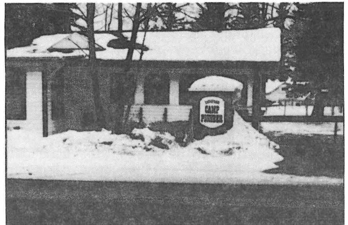
CAMP PIONEER--Site of 1987 winter retreat for members of the Great Lakes Regional Conference. The 1986 GLRC also convened here at Angola, N.Y.