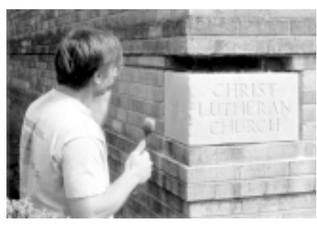
A hired restoration person prepare the corner stone for removal on April 29th.