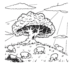
The Lord is my shepherd, I shall not want...

You may have noticed that the back (address) page layout has changed. We have moved the