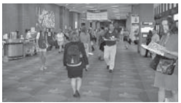
The lobby on Tuesday morning before the real crowd has arrived.