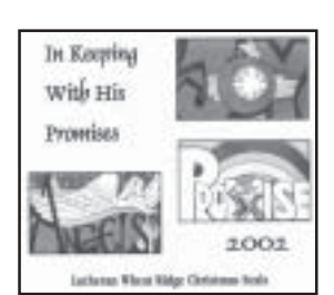
Wheat Ridge Christmas 2002 Seal. www.wheatridge.org

Remember to send to the D/L editor your church's newsletters!