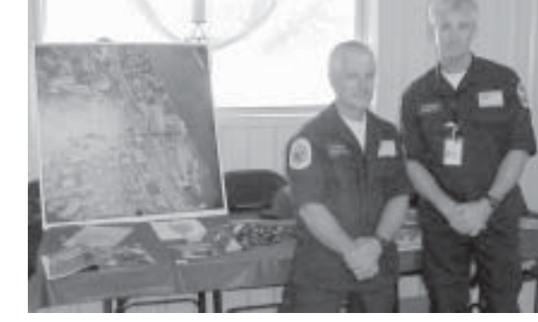
Special Guest... Texas Task Force-1 firemens.