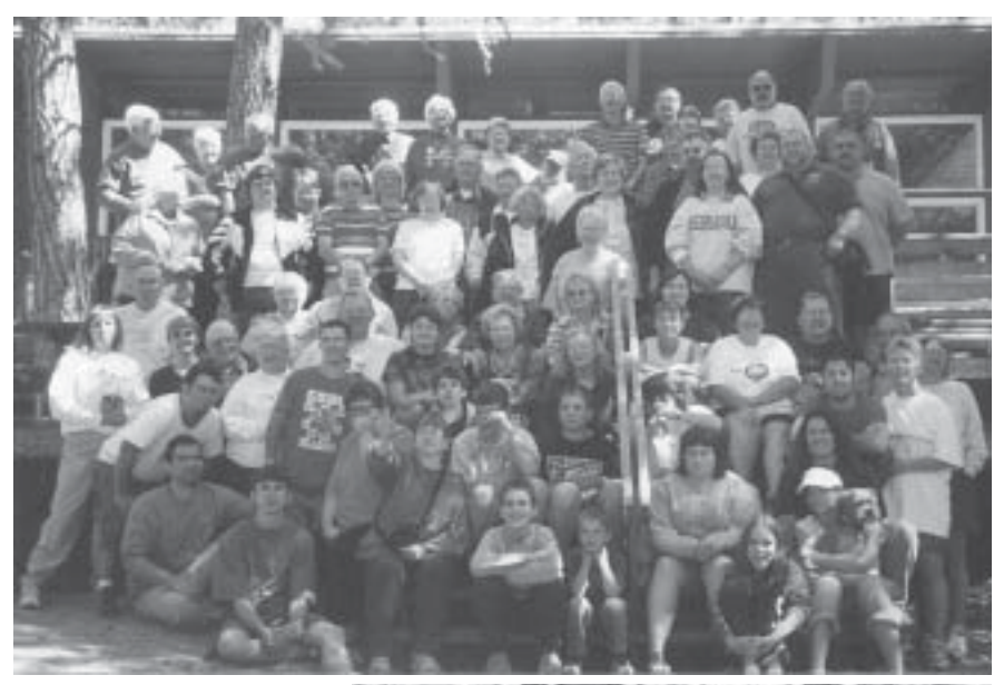
Above: Group shot of folks attending the Northwest Region ILDA Camp!