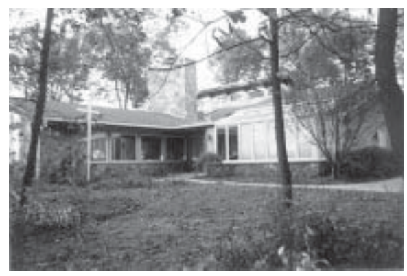
Front view of our new church building.