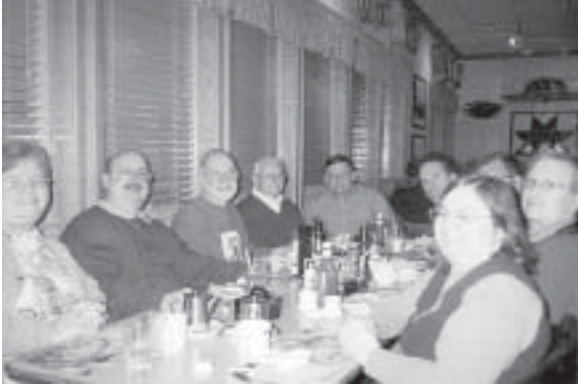
The Executive Board smiled at camera during breakfast at Bob Evans.