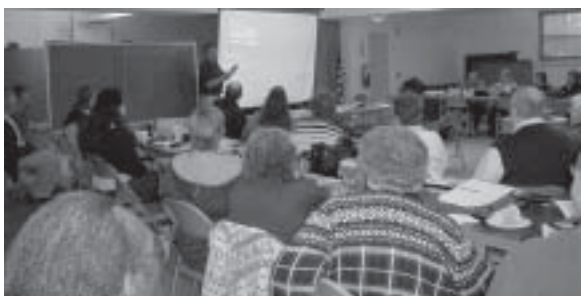
Workshops and meetings.