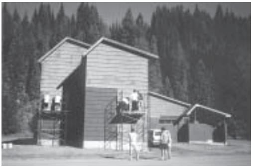
Mill Neck students on scaffolding paint a dormitory at the Shoshone Base Camp for their Servanthood Project.

on their disabilities, but their abilities. Through their hard work, students learn responsibility, selflessness and the importance of helping others. Past projects included trips to Phoenix, Arizona, where students worked on an Indian reservation; Kingston, Jamaica, where students helped to build a new school; and New York City, where Servanthood team members worked at soup kitchens and shelters.