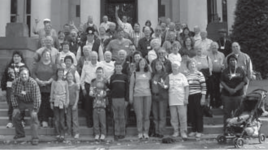
Group shot of GLRC 2003 attendees.