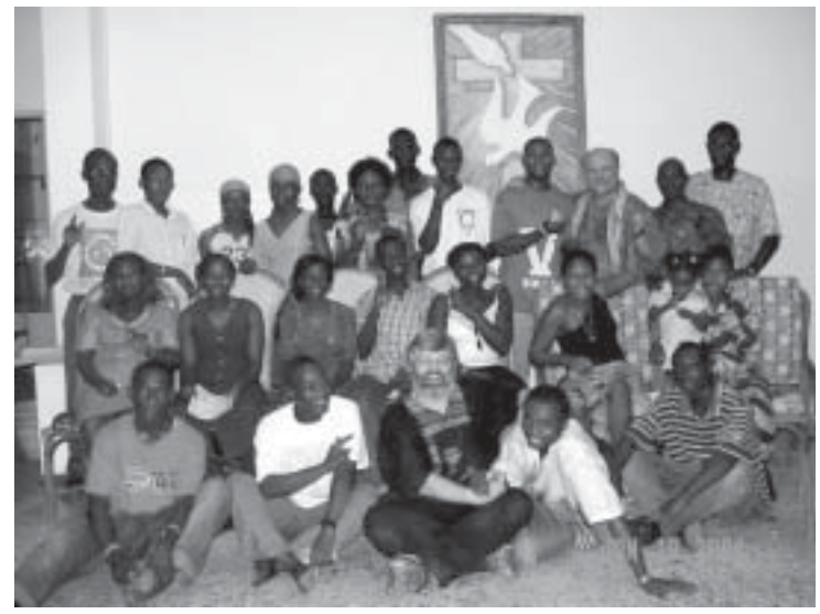
Above: group photos.