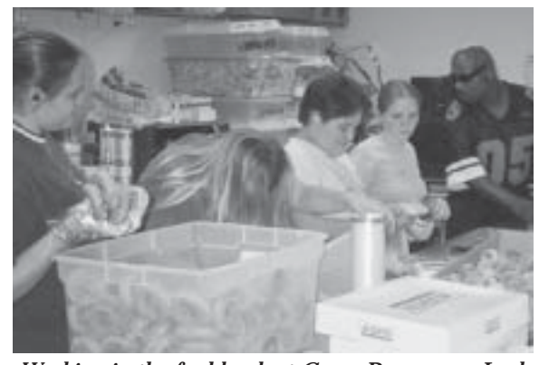
Working in the food bank at Grace Resources. Look at all those Krispy Kreme donuts!