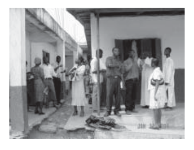
left: Deaf Fellowship. right: Classroom.