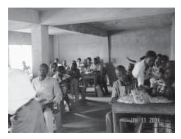
left: Learning God's Word.

right: Electric wirings hanging from ceiling.