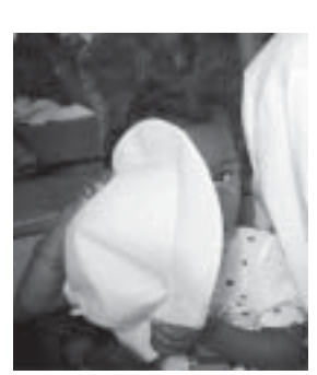
Little girl being shy from white men.