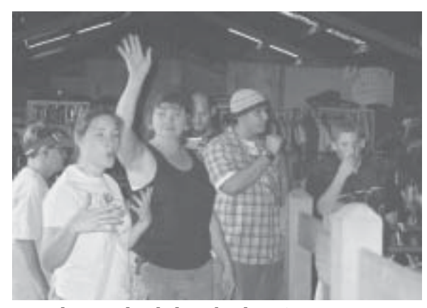
Working in the clothing bank at Grace Resources.