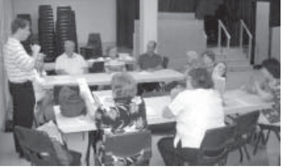
Visit ILDA's website for more information & registration on the next convention... www.ChristDeaf.org/ilda2007