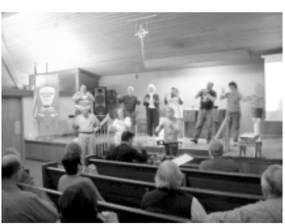
Friday Evening Choir. Page 6