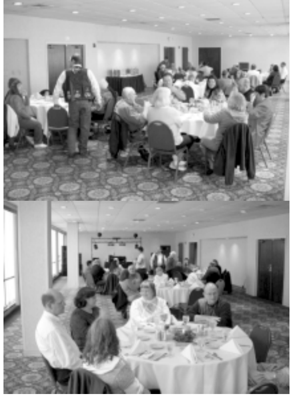
Saturday Evening Banquet at nearby Ramada Inn.