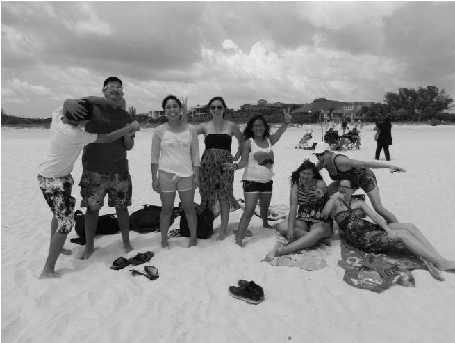
The church where we were staying was only a few miles from the beach so everyday after we finished our service projects, we would go enjoy the sand and surf.

because of lack of donations to ILDA, the service trips have not received ILDA support for the past two years. The service trips are open to deaf teens from all of our ILDA congregations, but often it is only Texas that participates. You are encouraged to invite your deaf teens to participate in the next service trip, TBA.