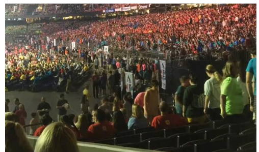
25,000 Lutherans gathered together for the National Youth Gathering.