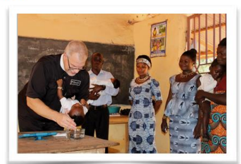
Bringing their children to be Baptized

The grant also helps us in our ministry with Evangelist Akorful in the village of Adamorobe. Our ministry reaches out to many Deaf families and individuals in and around the village. On one Sunday, we had four young mothers bring their baby boys to be washed in the lifegiving waters of Holy Baptism.