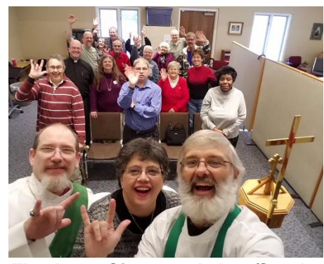
The Jesus Signs workshop/Sunday morning attenders from Alpha, Rochester, NY.