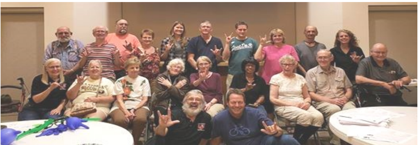
Jesus Signs workshop was held in Peoria, AZ in 2018. Pictured above are the workshop attendees and presenters.