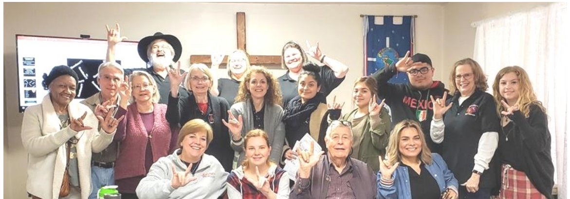
Jesus Signs workshop attendees and presenters in Houston, TX January 2019