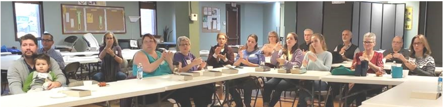
Jesus Signs workshop attendees in San Antonio, TX, January 2019