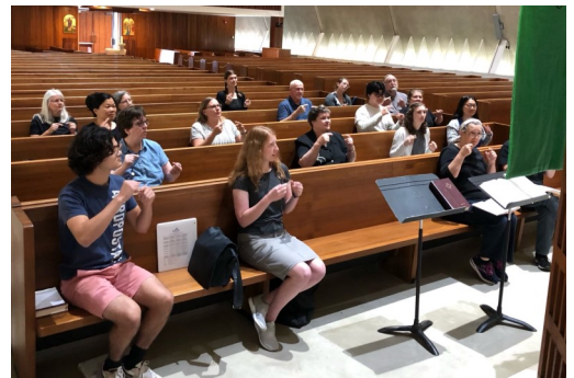
Participants in the Church Interpreter Training Academy (CITA) at Concordia Theological Seminary, Fort Wayne, IN, are pictured above.

Here's my email address: ilda.treasurer2021@gmail.com Thank you and God Bless!!!