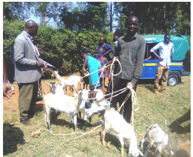
Goats that were purchased for families of Deaf children.