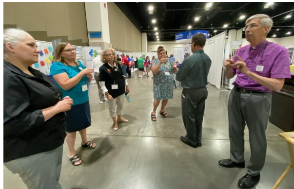
Social time at the LWML convention in Milwaukee.